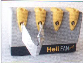
13 C-breath test analyser HeliFANplus

To complete the FANci device set the HeliFANplus has been developed. It is a compact and very reasonable 13 C-infrared analyser with a high sample throughput. It is especially designed for performing the Helicobacter pylori breath test at the clinics and at consultants' office. Together with this device you obtain the capable and easy to operate FANci -software, including more than 20 additional breath tests. Due to the availability of all common interfaces (USB, CAN, COM, LPT) you can connect HeliFANplus to your PC or laptop without any problems.